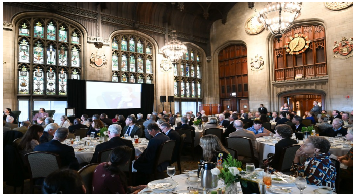
A packed house gathers at the University Club for Annual Luncheon