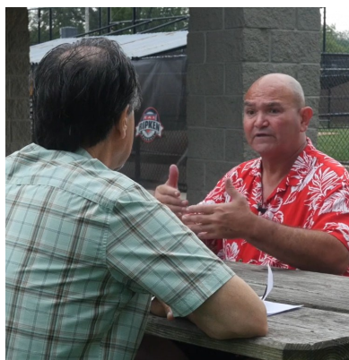
Out of jail and re-entering life

This past year, Chicago Bible Society saw continued growth as Family Connection and Care (FCC) program reached out to more families and provide more referral services. Expenses grew by 12% in 2025 as we entered a second full year of FCC. Donations increased by 7% primarily due to the success of the Gutenberg Award luncheon, which had a record attendance of 229.