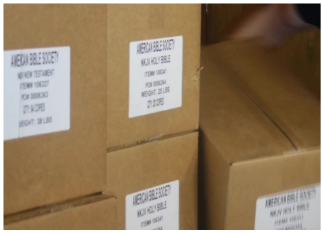
Bibles awaiting distribution to the Jail